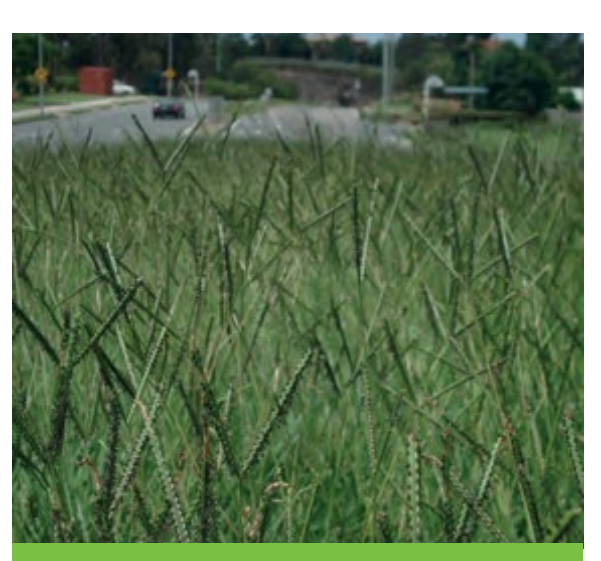
Bahia Grass Seedheads